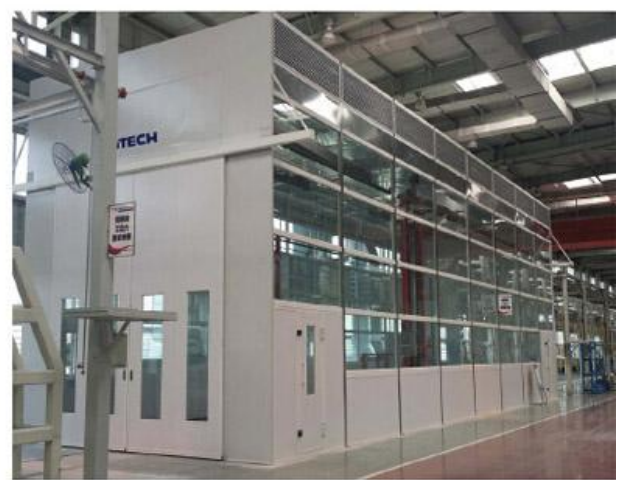
Jilin high tech Electric Vehicle Co., Ltd.