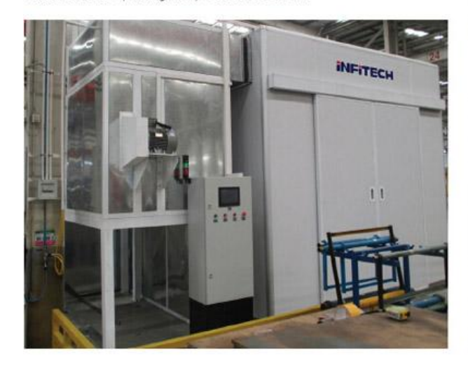
Hitachi elevator (Guangzhou) escalator Co., Ltd.